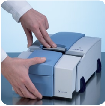
ALPHA offers full sampling flexibility.