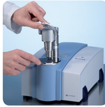
ALPHA's Platinum ATR sets new standards in ease of use.