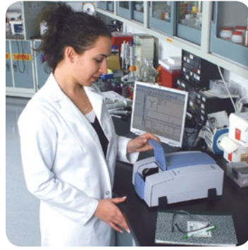
ALPHA will not consume your valuable bench-top space.